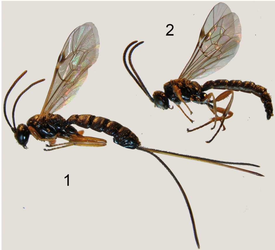
Figs 1–2. Exeristes roborator (Fabricius, 1793) emerged from Diplolepis rosae (Linnaeus, 1758) galls, 1 = female, 2 = male

Belonging to the community inhabiting galls of Diplolepis species, E. roborator was reported until now only from southern Europe and the Middle East (Iran, Turkey and Sicily (Italy) (LOTFALIZADEH et al. 2009, ÖZBEK et al. 1999, RIZZO & MASSA 2006). Studies dealing with the same community from central, north and western parts of Europe have not reported the presence of the ichneumonid E. roborator (ASKEW et al. 2006, CONSTANTINEANU et al. 1956, LÁSZLÓ et al.